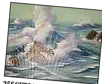
25SCFT04 Ocean Scene