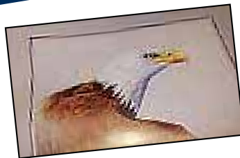
25SCFT01 Bald Eagle