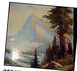
25SCFT06 Mountain Landscape