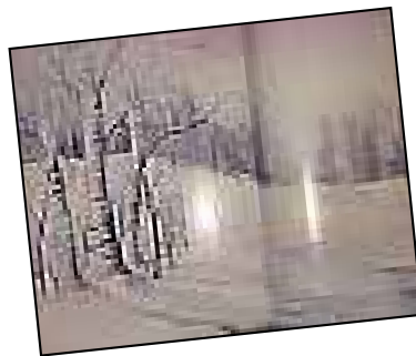
25SCFT03 Undisturbed Birch Trees