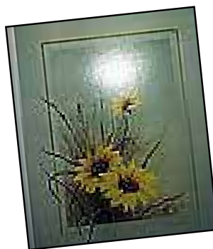
25SCFT05 Daisies in French matt